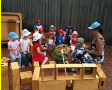
Dramatic Play.... Going on the bus to the Fun Park